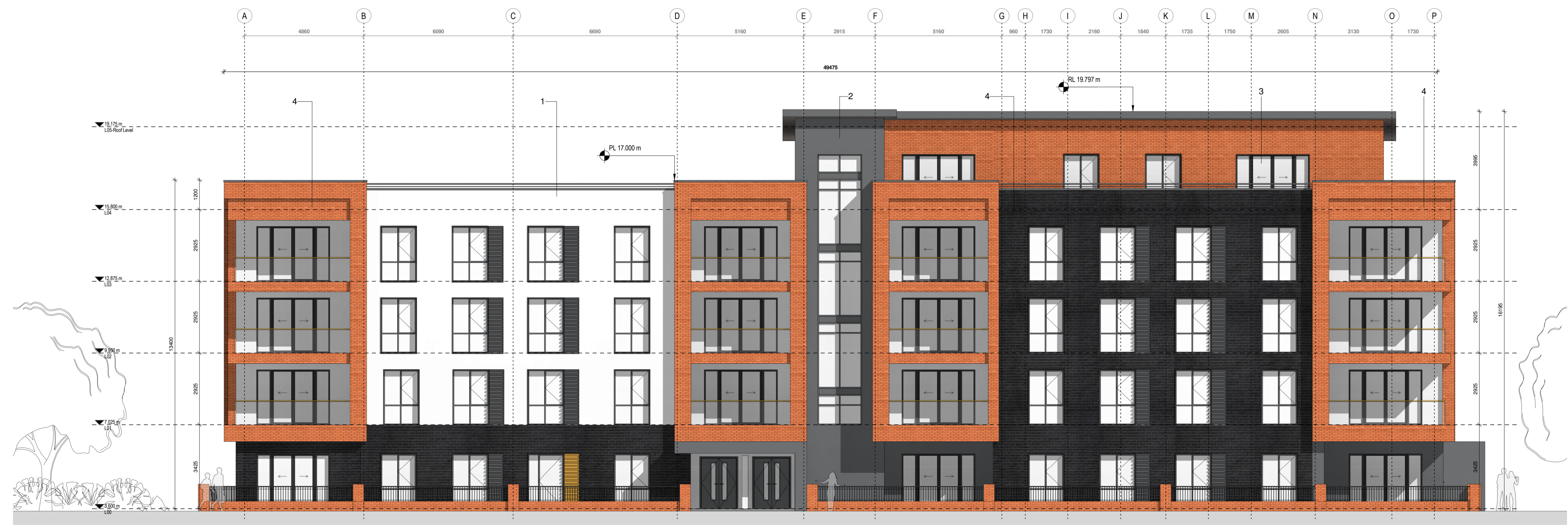
2 ELEVATION.B 1:100 @ A3

P03.04 12.03.18 | BLR | Issued to Planning Consultant for Review P03.02 25.01.17 | BLR | Issued for Client Review Meeting P03.01 18.08.17 | J.Mc | S10 - Issued for Planning