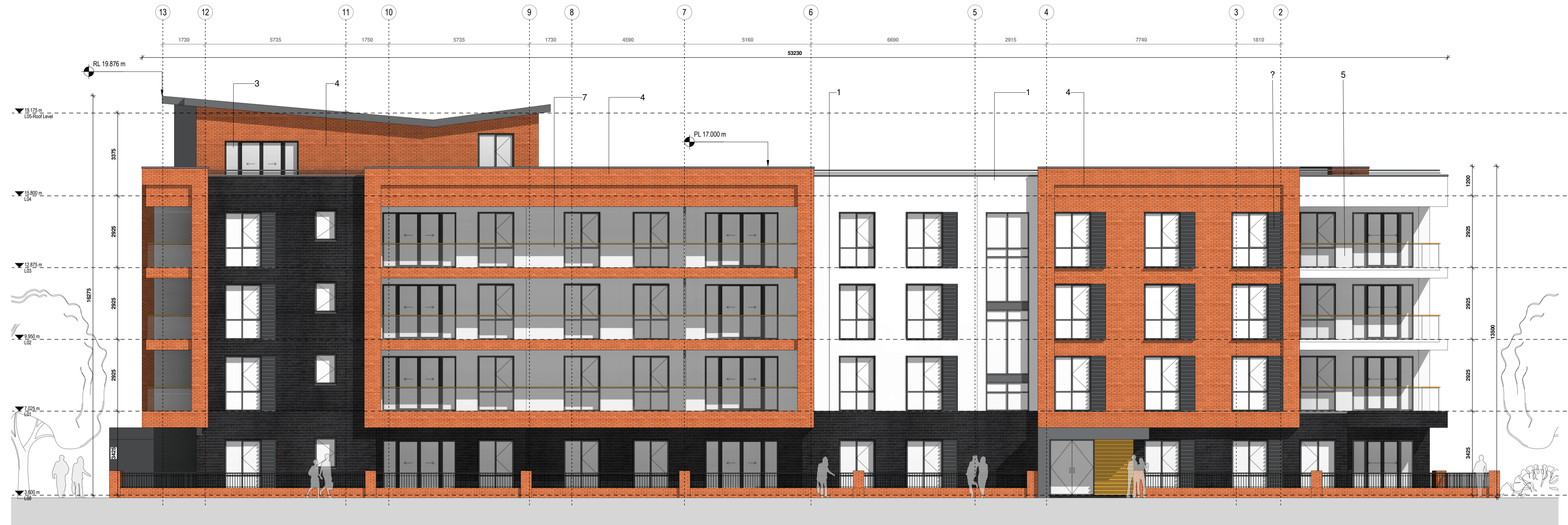
1 ELEVATION.A 1:100 @ A3